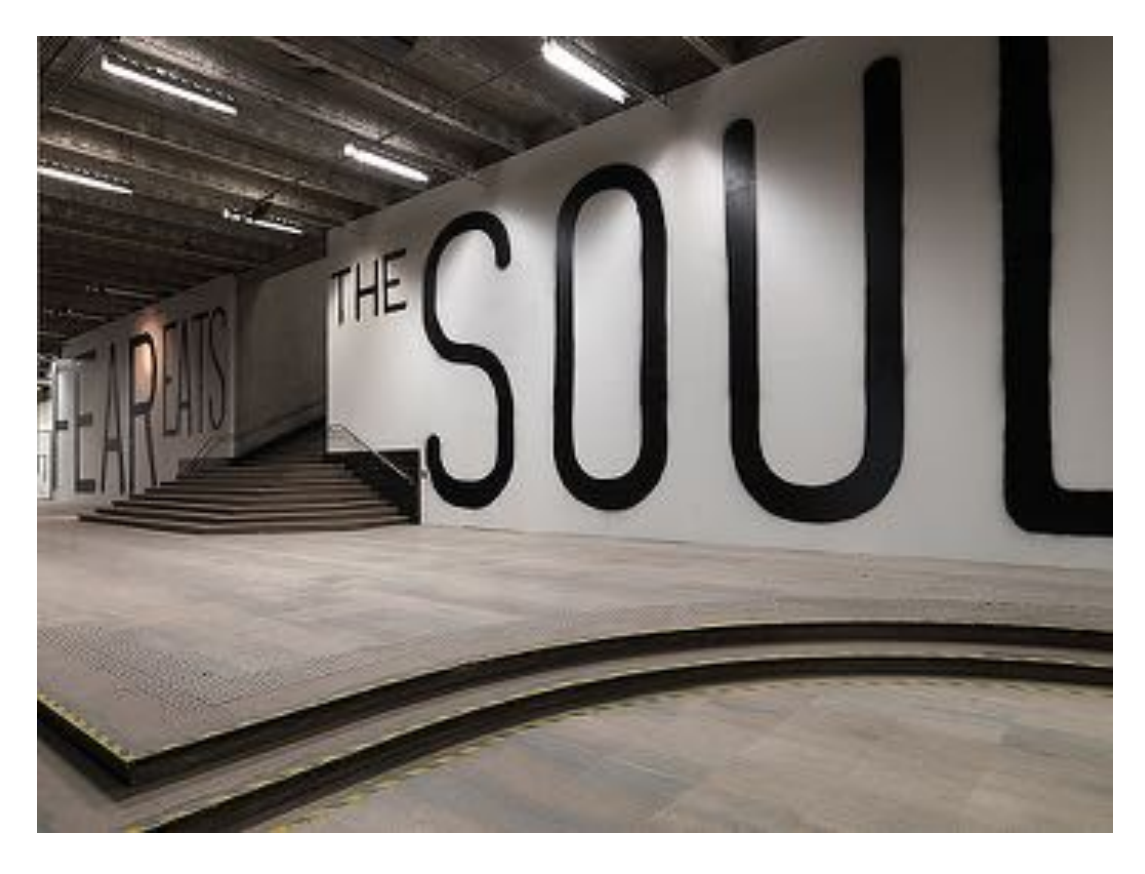
Fig. 2. La Triennale 2012 - Intense Proximité, Palais de Tokyo, Paris, April 20 to August 26, 2012. Ground floor entrance, in which the title of a Rainer Werner Fassbinder's movie, "Angst seele auf", from 1974, translated into "Fear Eats the Soul", was painted on the walls.

The exhibition entrance (Figure 2) is marked by the phrase "Fear eats the soul", the English translation of the title of a film by Rainer Werner Fassbinder ( Angst seele auf , 1974). The phrase that frames the entry to the exhibition route is hand painted directly on the wall, instead of printed with neutral types. Thus, the expression is not confused with the signs printed by mechanical processes, and marks the curator's physical presence in the space. The expression "fear eats the soul" is painted on the wall as if it were a trace of a sudden unscheduled intervention, like the graffiti covering the walls of abandoned buildings. The expression in its apparent spontaneity is, as is the curatorial discourse, an individual testimony. The phrase seems to be a mark left by someone with the intention of sharing a personal belief, or a revelation, with the other visitors. The quoted expression refers to a person's inner being (one's "soul") and takes on an almost monumental scale (eating the whole setting of artworks). Just as graffiti does, the expression challenges the fear of transgressing, and also fear itself. It is like saying "I've been here and seen this", or "careful, if you do this (feel fear) you will suffer the consequences (your soul will be corroded)".