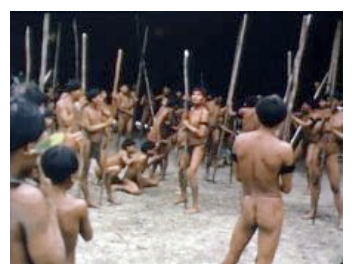
Figure 4. Timothy Asch, The Ax Fight , 1975. Still from the 16mm film.

The theme of proximity continues in the work of Timothy Asch, The Ax Fight , a film made in 1975 (Figure 4) which, as previously mentioned, is highlighted on the cover of the exhibition's catalog. This time, the group observed is the Yanomami in the Brazilian Amazon. The proximity to the ethnographic writing of Lévi-Strauss is established in that a degree of awareness of the medium itself is expressed. That is, Asch explores the elements of photography as language (light and shadow, sequences, camera positioning, among others) to mark his presence in the space of his fieldwork.