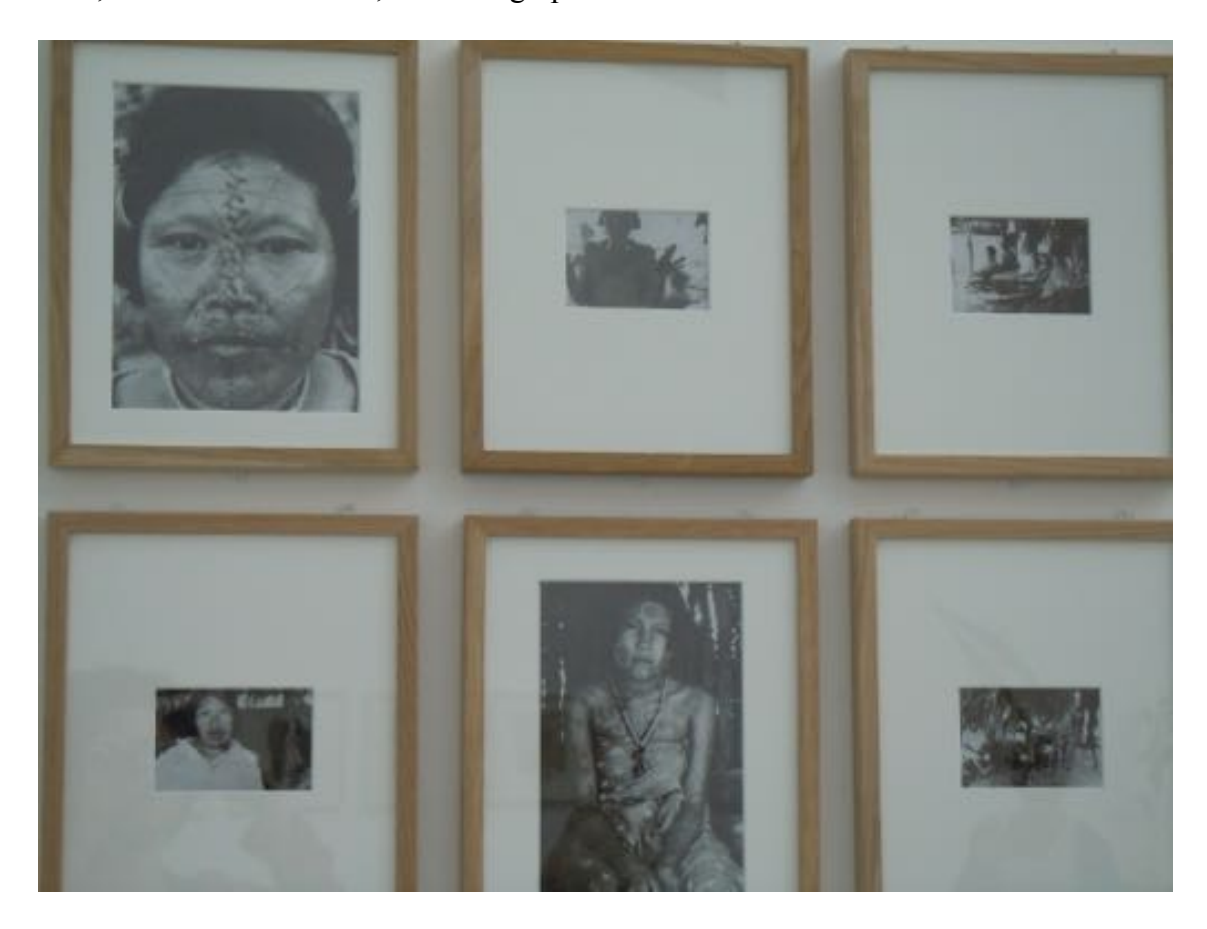
Figure 3. Claude Lévi-Strauss. Photographies realisées lors de voyage de recherche , Brazil, 1937. Tirages d'expositions. Musée du quai Branly, Paris.

The opposition between the inclinations of S1 and S2 is caused by situations in which the Indian "allows himself to be seen" ( ibid. , p. 98) and, on the other hand, generates in the ethnographer-observer a moral dilemma. The ethnographer wavers between the need to see, a wanting to see in the name of science, and not wanting to see in order not to expose his indiscretion. We will never know whether there is a manifest want on the part of the Caduveo people. Even if they are indifferent to the presence of the Europeans (Figure 3), which does not seem to be the case, they are caught by Levi-Strauss' indiscretion, that is, they want not to be seen, and at the same time, the ethnographer does not want not to see them.